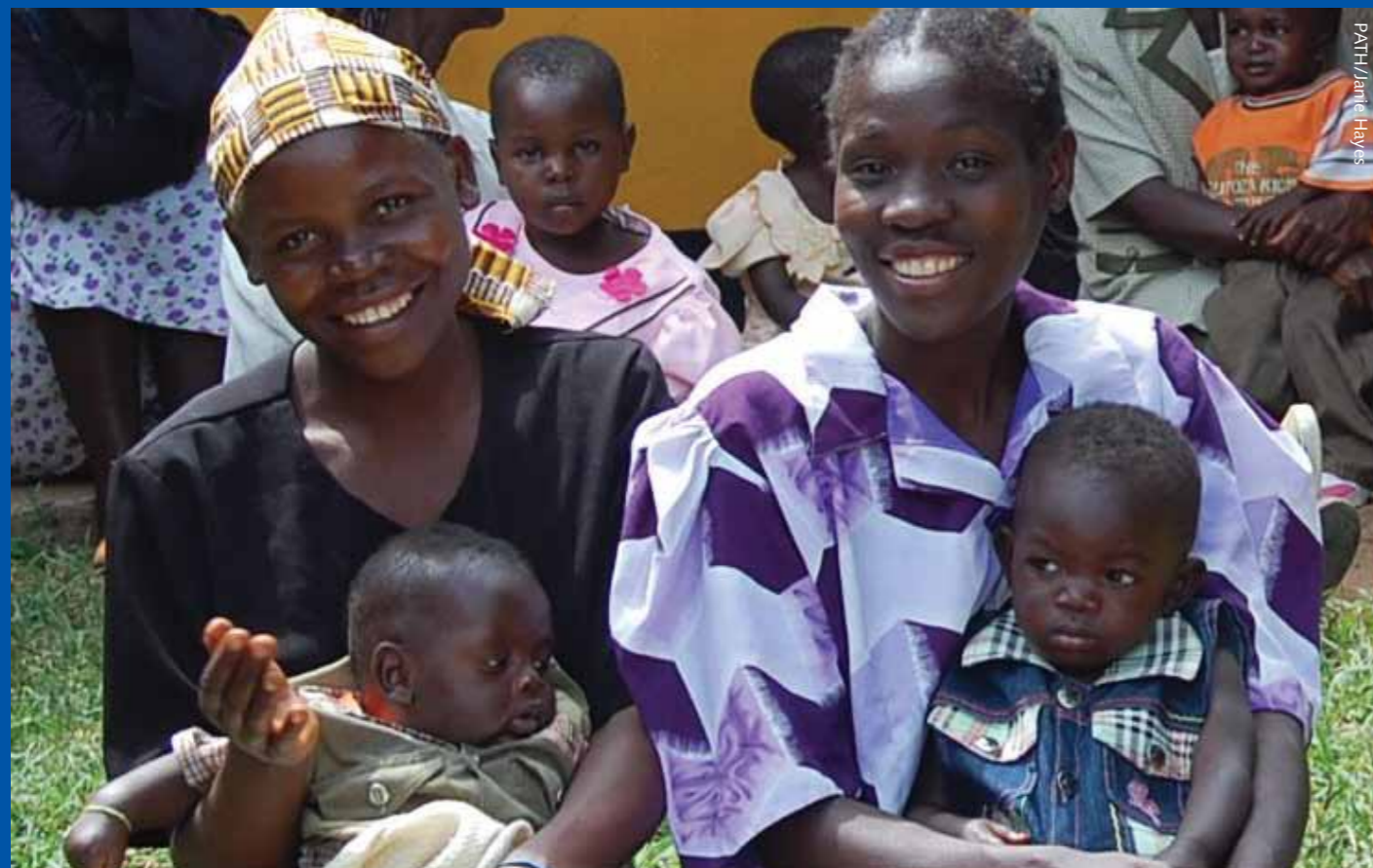
Mothers wait to have their children seen at Webuye Health Clinic in Kenya's Western Province.

Keeping the promise: united to achieve the Millennium Development Goals, UNGA resolution, 17 September 2010 1