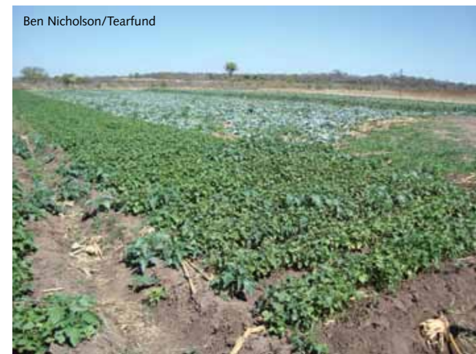
One of 20 nutritional gardens in Bulawayo, Zimbabwe - with land provided by the Bulawayo City Council. Each garden is divided into household plots where families can grow vegetables and medicinal herbs to boost nutrition and health. A total of 983 families now benefit from these gardens.

Since the Government of National Unity was created in February 2009 the economy has begun to grow, but for the poorest and most vulnerable people the threat of hunger, disease and destitution is still a stark reality. However, in Zimbabwe's second largest city Bulawayo the local government is working with the community and local faith-based organisation Churches in Bulawayo to provide an integrated approach to food security and safe water.