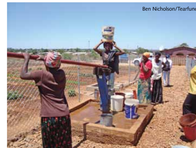
One of 20 rehabilitated boreholes, which provide a safe water supply for drinking and vegetable cultivation for the nutritional gardens. Approximately 20,000 people have benefited from the borehole rehabilitation programme.

Access to the gardens and rehabilitated boreholes has enabled these communities to minimise their liability to water-related diseases, drought-related disaster and hunger. It has also built a sense of dignity for the beneficiaries and given them a new place in the community. Now other residential areas are asking if they can have similar projects.